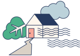
Disaster Risk Management